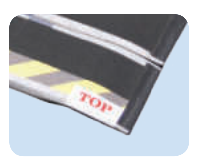
Marked 'TOP' to show head of ramp, grip tape, pads at both ends